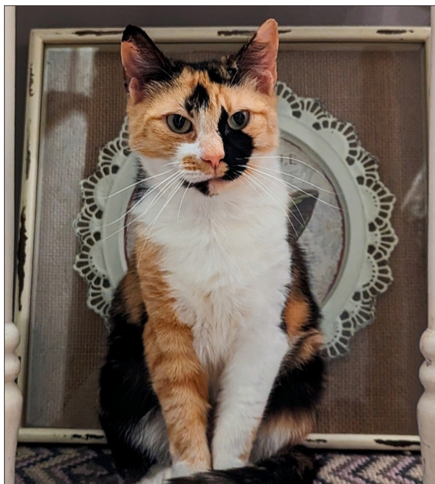
CARED FOR: Finn's cat Angel.